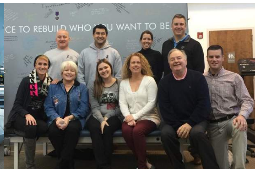
"Coming together is a beginning. Keeping together is progress. Working together is success!"