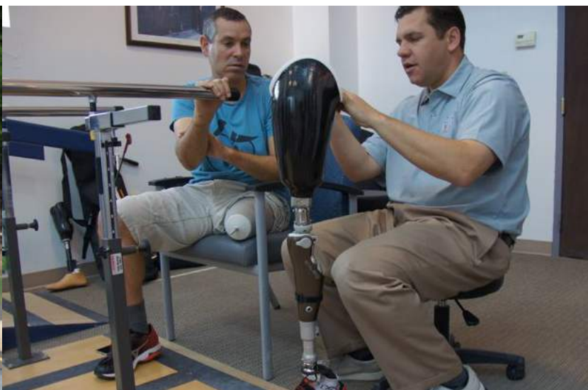
Determined people working together can do ANYTHING! #superhuman #transfemoral