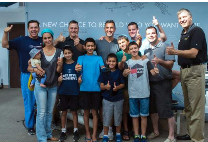
Every day may not be good BUT there is something good in every day! #teamwork #success #family